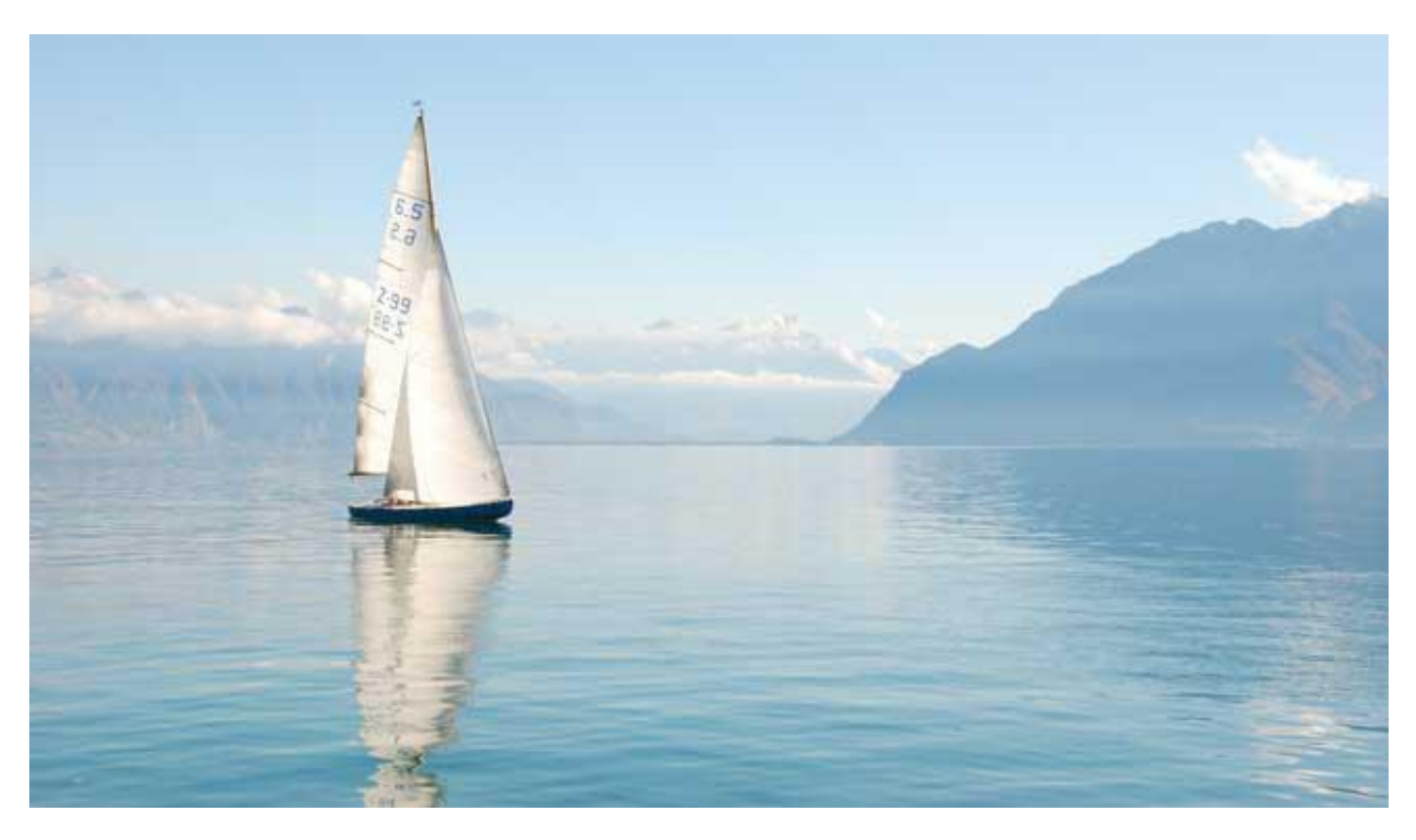
7 Secret Sailing Spots to Discover with a Yacht...