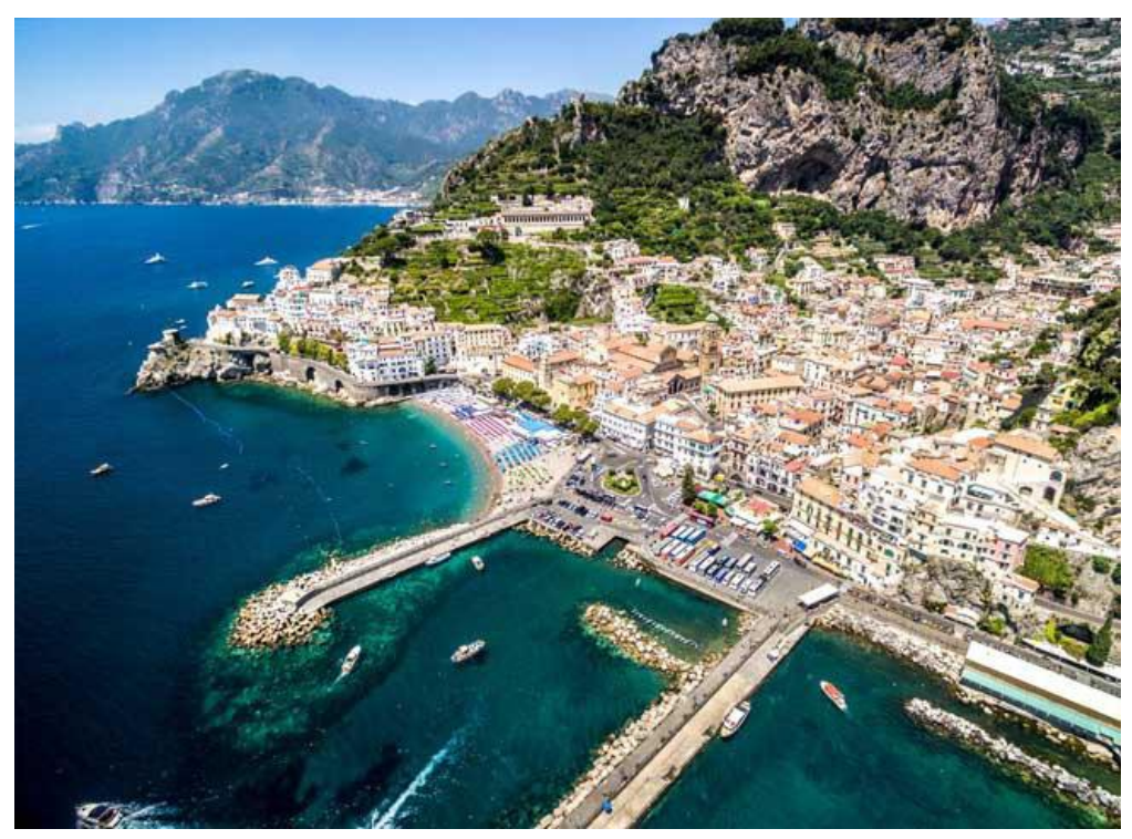
An aerial view of the Amalfi Coast in Italy

Another popular destination that has grown in popularity is Croatia. Though a relatively small county, Croatia offers many types of holidays, depending which season you decide to go. It is well adapted to please any generation from young to mature. You can visit the long scenic coast, or take a ferry ride to one of the beautiful islands, but you will have to do some research on which to choose because Croatia has well over 1200 islands. If you are visiting during the winter, be sure to visit the main town of Zagreb. Summer holidays are best spent along the coast in ancient towns such as Dubrovnik, the pearl of the Adriatic, which has gained popularity since it was used for filming in the Game of Thrones series.