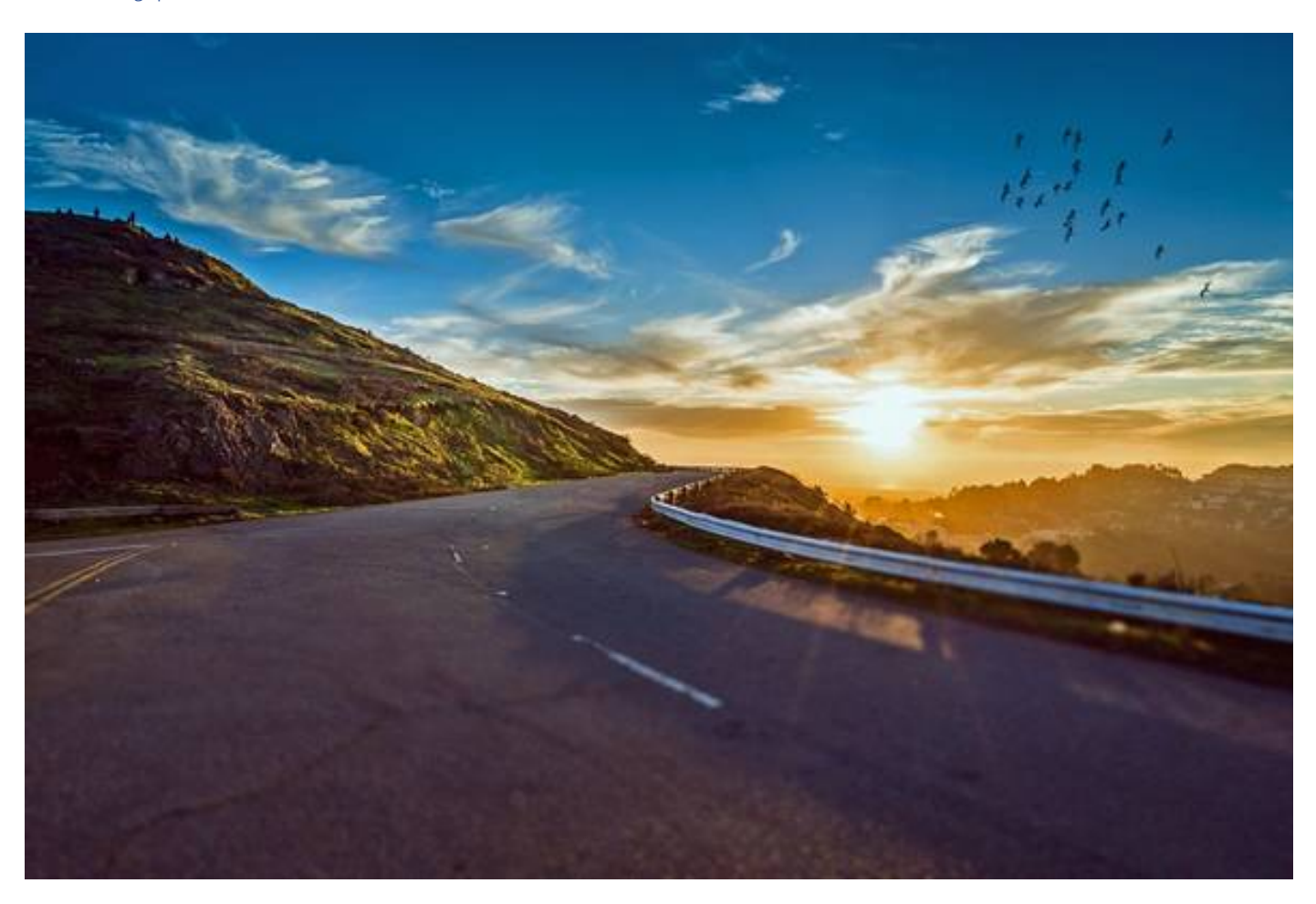
Top 6 Routes for an Epic New Zealand Road Trip