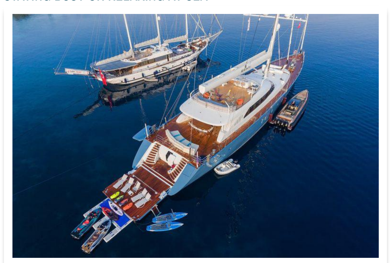
The gulet All About You shows off her watersports gear.

Blue cruise itineraries typically include time each day for swimming, snorkeling or just relaxing while docked. Gulets have fixed stairs that lead to the water where the crew will ready fishing rods, water skis, a banana boat or wakeboards.