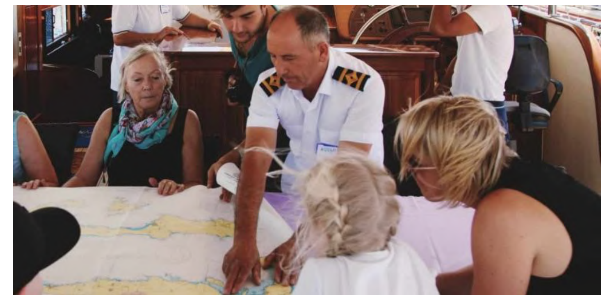
Gulet captain charts a course with three generations of sailors.

Gulet Blue Coast small ship cruises typically stop at Bodrum (a fun port with a 15th-century castle, shops and nightlife), lively Marmaris with its marina and waterfront cafes, and the hidden swimming lagoon at Fethiye.