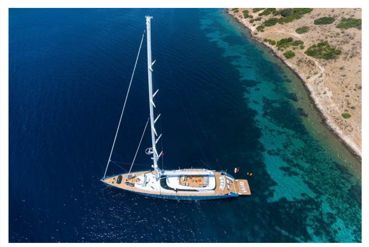
The gulet All About You is anchored off the coast of Turkey.

Imagine being at sea, skimming along a forested rocky coast, sunning on gleaming golden beaches and snorkeling in aquamarine waters; your dream is a chartered Blue Coast cruise holiday .