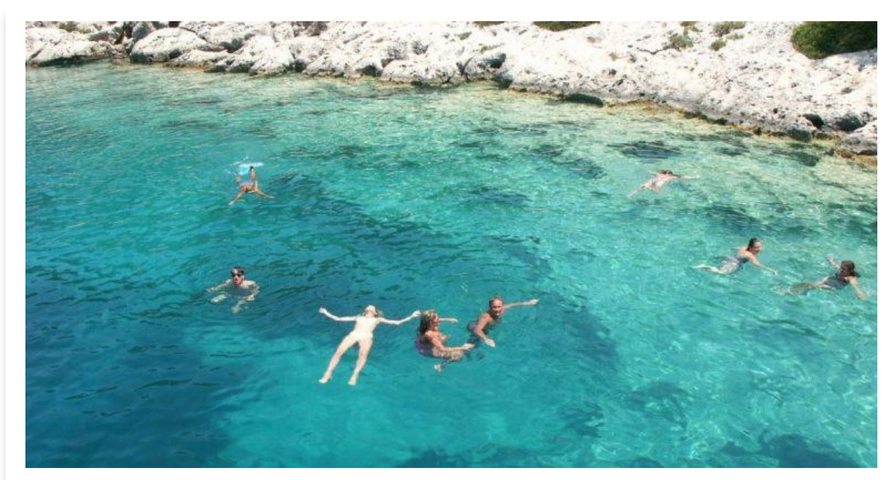
Swimming is one of the Aegean's greatest pleasures.

Planning where to go is the greatest pleasure. A <u>favorite itinerary</u> is the weeklong sail from Bodrum to Gokova and back because it provides a balanced mix of action and relaxation, with many stops to show off Turkey's natural beauty, cities, and islands.