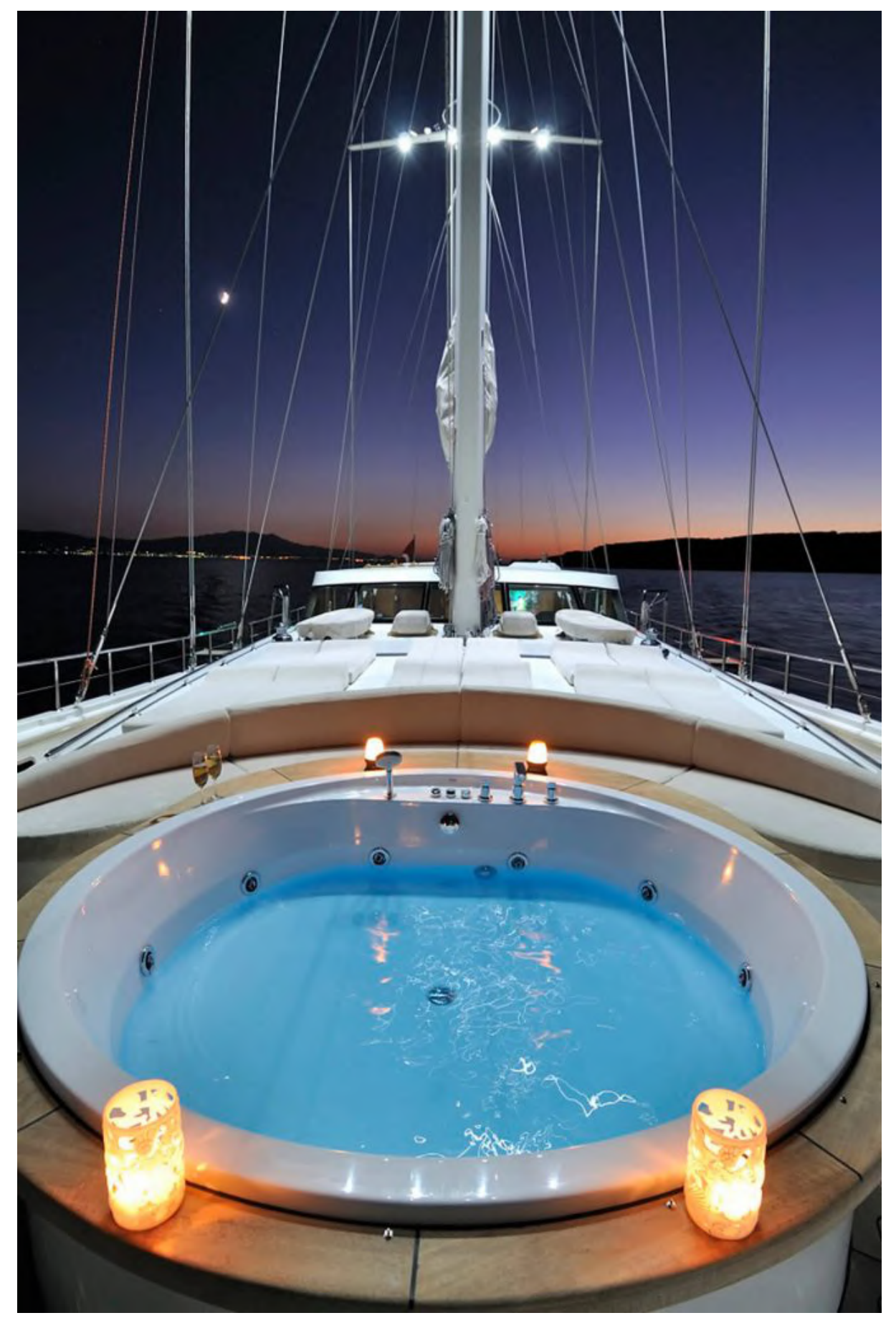
Sunset from the deck of the Dolce Mare yacht.