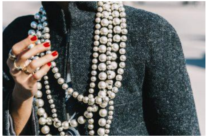
Why Pearls Are Making A Comeback To The Fashion Scene