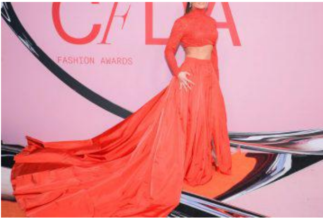
Best Dressed At The CFDA Fashion Awards 2019