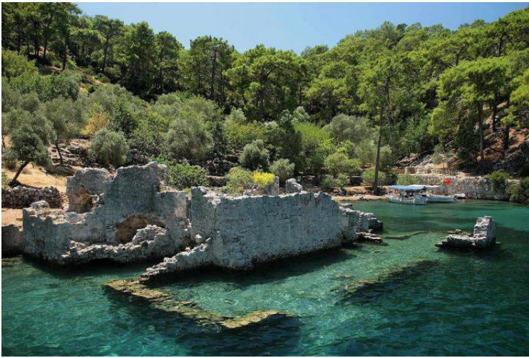
Ruins at Cleopatra's Bay