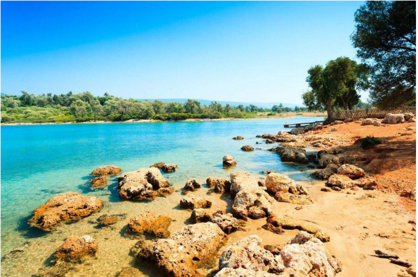
Coastal landscape on Cleopatra

Next you will travel to the Seven Islands of the Gökova bay, which contain some beautiful coral reefs. Your gulet has snorkelling equipment so you can get up close and personal with nature. Highlights include a stop at Kufre Bay, which is surrounded by fragrant pine forests, and Sedir Island (also known as Cleopatra Island) famous for its beach made of seashells.