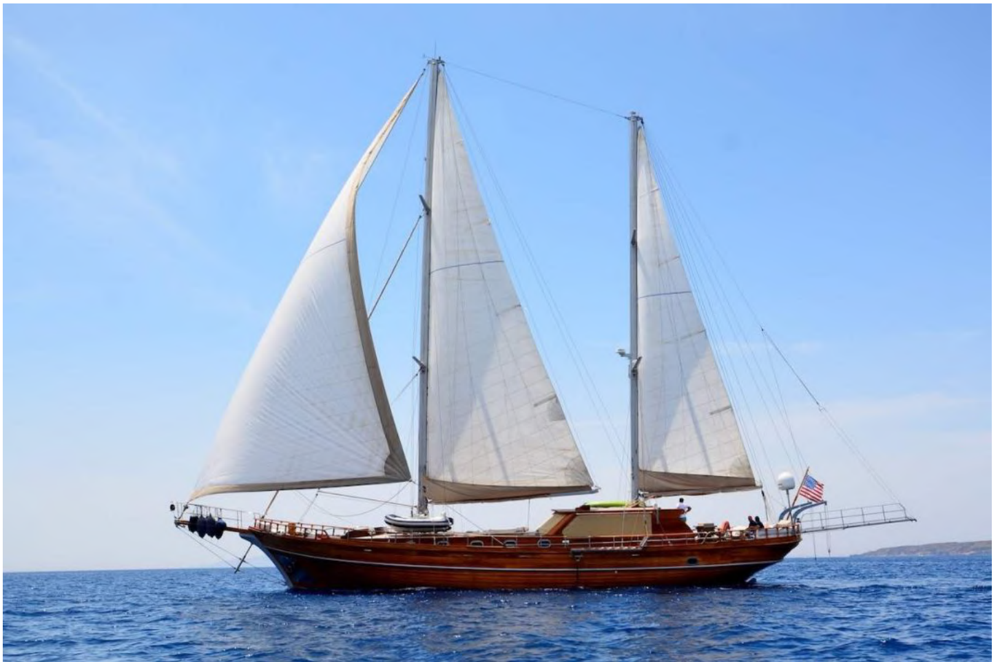
Gulet Artemis & Simay

Turkey Luxury Gulets organise chartered gulet trips for 3-12 guests with a choice 21 luxury gulets. These range from the 24m Gulet Artemis & Simay (3 cabins) to the 56m Gulet Regina (6 cabins).