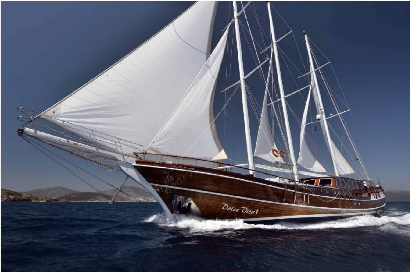
The Dolce Vita, one of the luxury yachts from Goolets.

Think about it — how long have you wanted to take a luxury vacation with your loved ones, or go on a romantic getaway that is unique and a bit off-the-beaten path? There are some remarkable destinations on on this planet — isn't it time you splurged? Here is a round-up of 5 memorable holiday destinations for every occasion from Japan to Europe , all of which make an ideal luxury vacation.