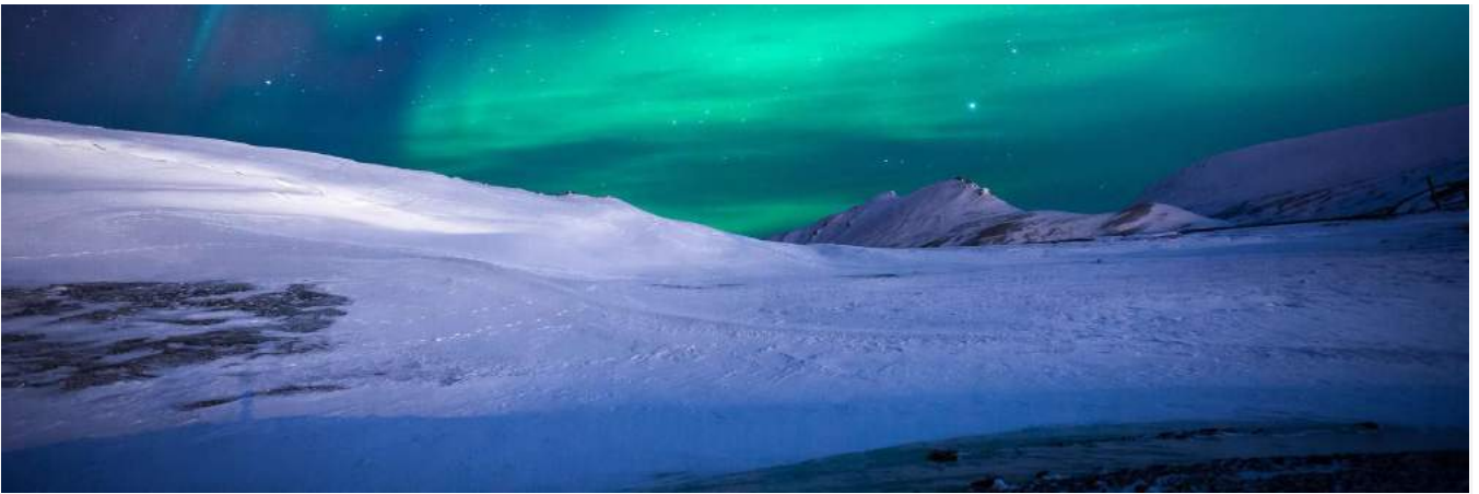
The Breathtaking Aurora Borealis

Traveling between November and March offers you the best chance of catching this natural phenomenon. You can go on a tour, rent expert guides who know the best spots to see sighting that beauty, plus you can get a photography tip or two. Later, you can enjoy luxurious bubbling thermal pools of the Blue Lagoon , spend the night in the luxurious country lodge, and perhaps end the day with a mouth-watering lobster feast at the cozy seafront restaurant.