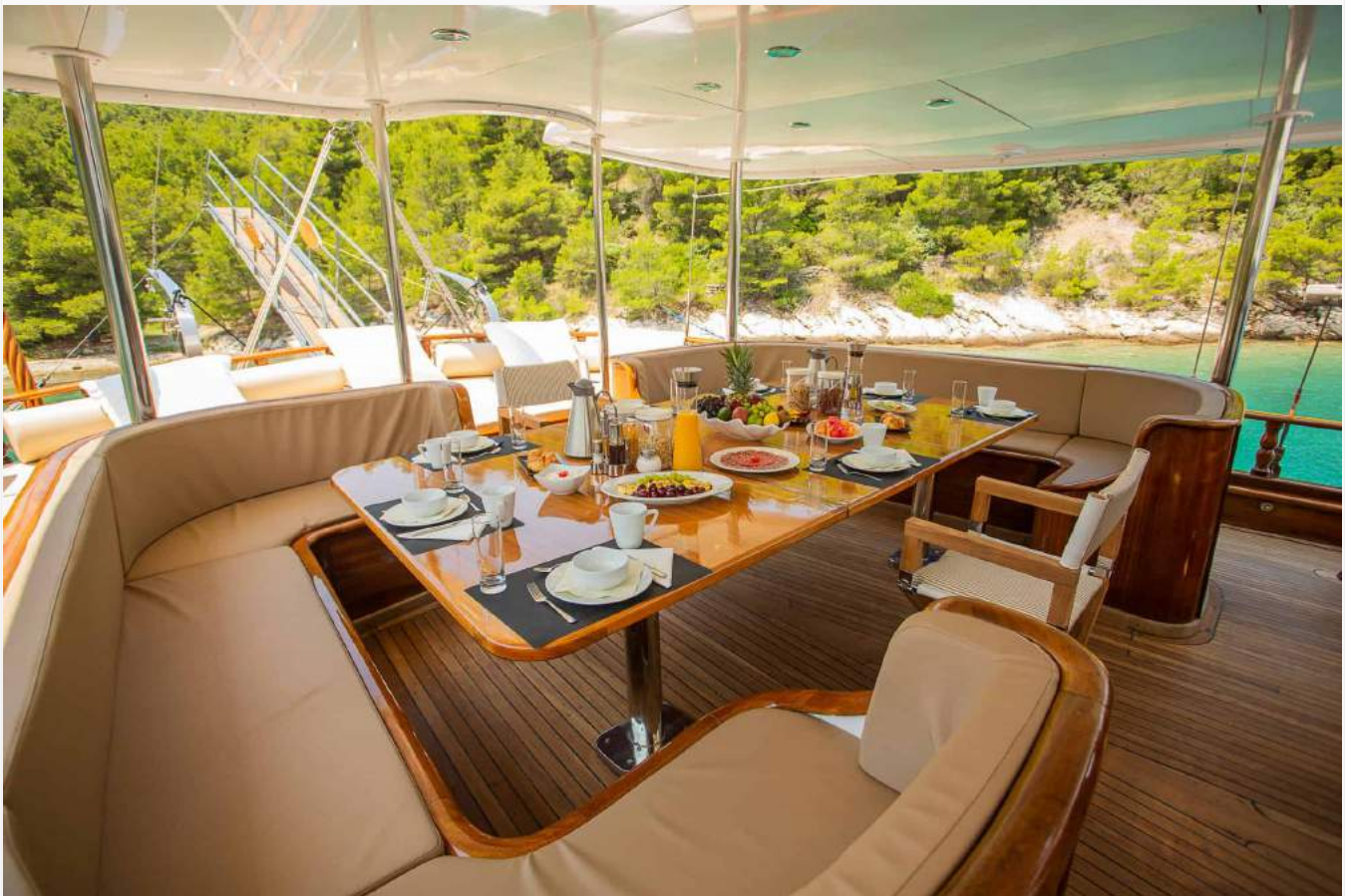
Above and below: pure luxury on board one of the luxury yachts you can rent.