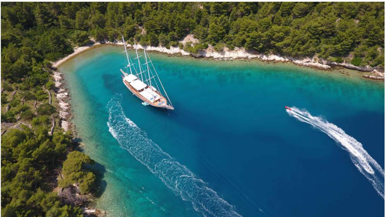
The Gorgeous Mediterranean.

The coastal region also has a typical Mediterranean climate with warm summers and mild winters, so you can expect numerous sunny days with minimal chances of bad weather. It doesn't get any better than this, does it? Stunning, right?