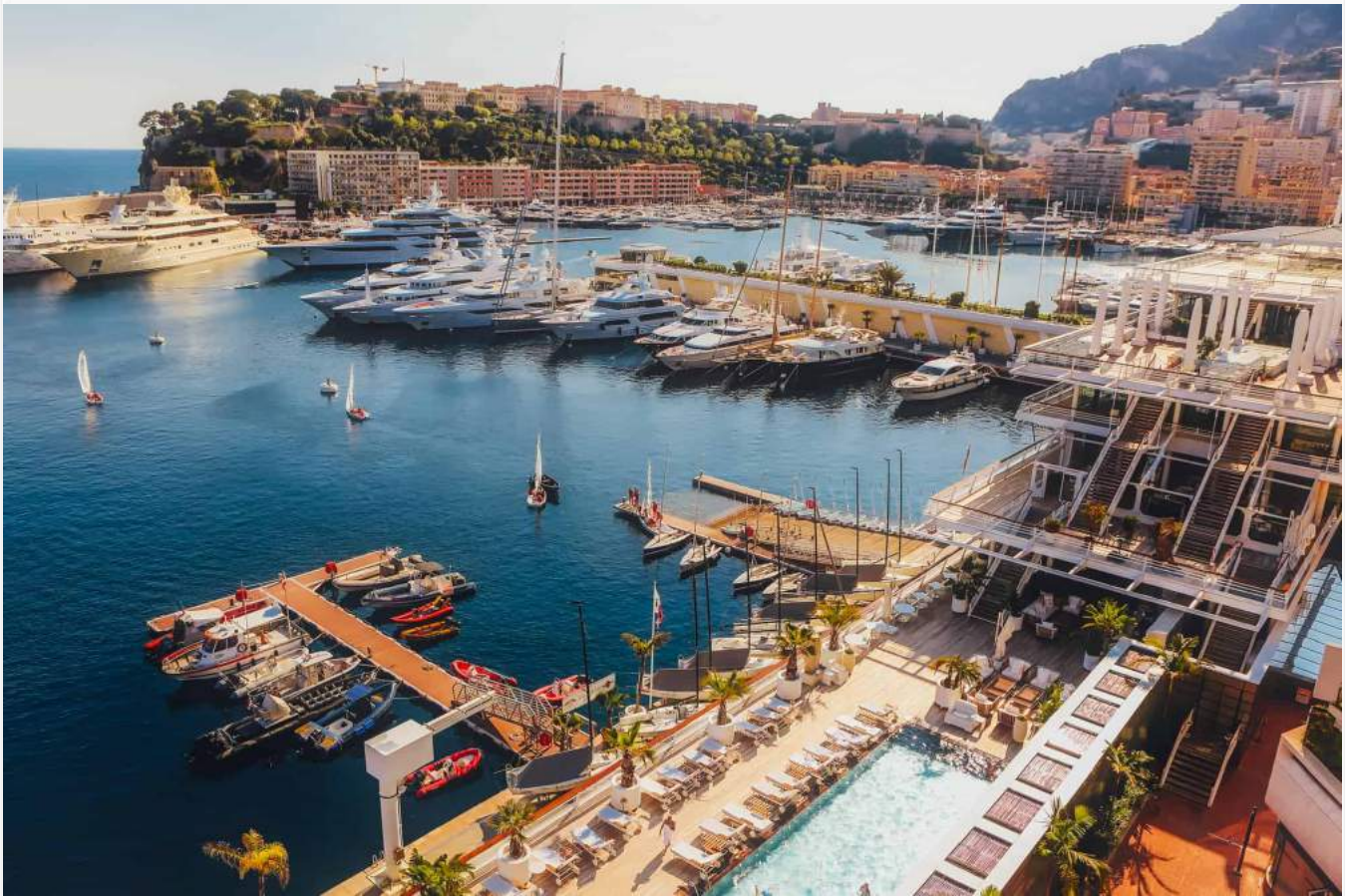
A view of Monaco.

the most alluring holiday resorts in the world. The glittering coast of French Riviera greets thousands of visitors every year for high profile events. They include the Cannes Film, Monaco Grand Prix, Luxury Travel Market, and many others.