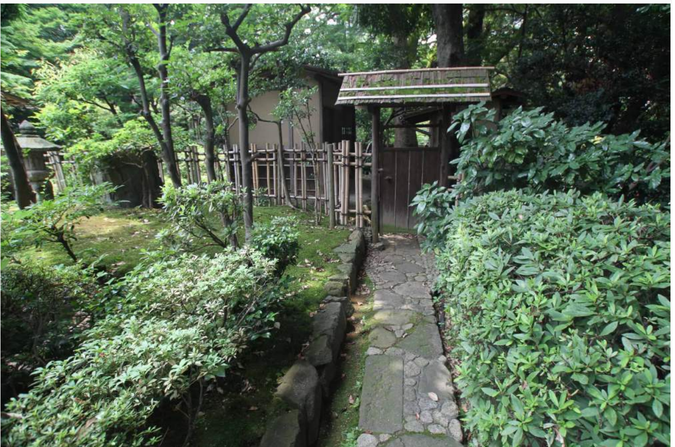
Gardens at the luxurious Otani Hotel

The hotels offer top-quality Japanese cuisine too, high-end accommodation and experience. You can also go on diverse tours, experience culture-rich neighborhoods, see local fashion, and catch glimpses of geisha in their kimonos. You can even try a kimono yourself.