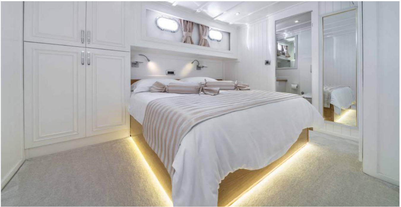
Even sleeping is a luxurious experience.

By traveling on the sea in comfort of a yacht, you get to experience the ultimate freedom and you'll see the most of what coast offers in the shortest amount of time! Furthermore, all luxury yachts come with a crew that consists of a professional and experienced captain, private chef, hostesses, and sailors, that will provide you with high-end service and a luxurious time. It will be one of those memorable experiences that will last with you for a long time.